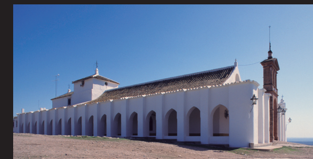
Hermitage of Nuestra Señora de Setefilla

Lora del Río will experience epochs of splendour throughout the XVII, XVIII and XIX centuries, as it is reflected in its beautiful houses and buildings which should be protected and conserved for future generations.