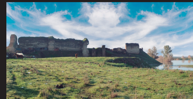
Castle of Lora del Río